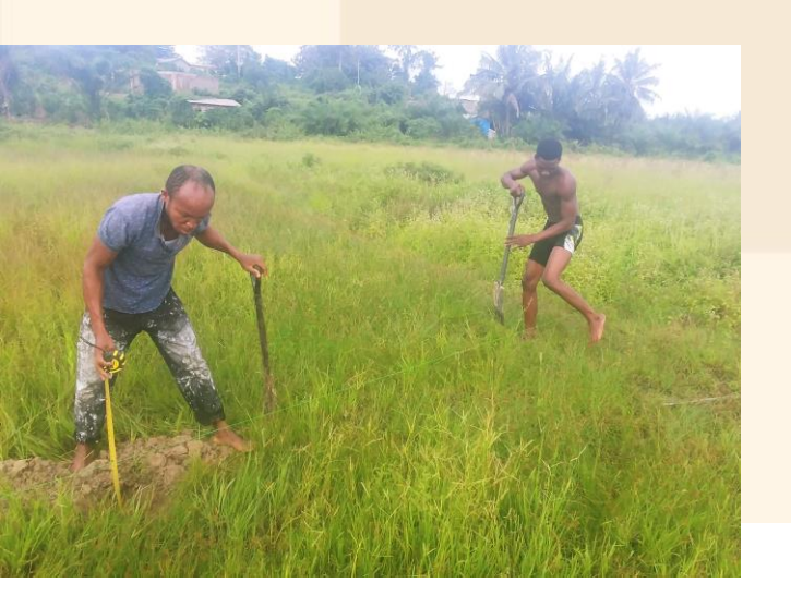
400X600 feet land is bought